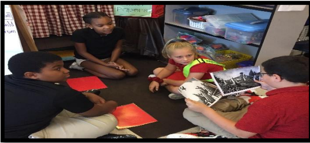
These students are working together to think of the plot of the story and then put the illustrations in sequence. It was a fun way to kick off plot!

October 7 th : NO SCHOOL (Teacher In-service)